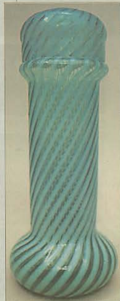
Right: This 11¼in jar with stopper was originally used for storing straws. Its opalescent swirls and striking aqua and white finish took it to $4,100 in the saleroom.