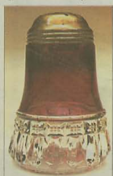
Above: The collector who paid $2,500 for this 4¼in sugar shaker can smile in the knowledge that this piece was previously unrecorded in ruby stain.