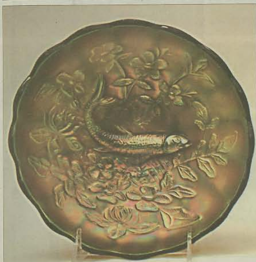
Above: Carnival glass performed well in the auction. This 2½in high, 8in diameter scallop-rimmed bowl with a fish imprint on its sides achieved $1,050.