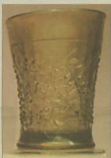
Above: The H. Northwood Co., one of the major manufacturers of Carnival glass, produced this ice-green Wisteria tumbler that sold for $400.

in the bidding up to the higher price ranges."