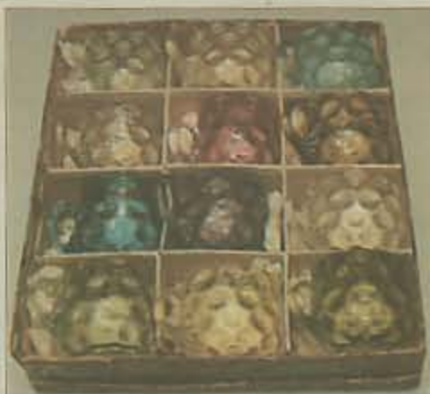
Above: Not only were these polka dot lemonade cups in near-perfect condition, they also came with the original packing box and lid, which made it easy for the winner to transport them home after paying $3,100.